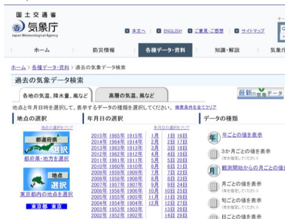
Figure 1. Searching page (Tokyo)

There was enormous data accessible in the webpage of the Japan Meteorological Agency (JMA). After opening the webpage, you click "Types of data and materials", "Weather data search", in turn, and select city (Fig.1). Then, you scope "Yearly data", "Detail (Temperature, Vapor pressure & Humidity)" in order. The Table 1 shows the extracted example of the data, shown in the website.